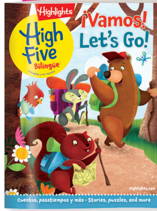
High Five Bilingüe Ages 3–5 Learn More >