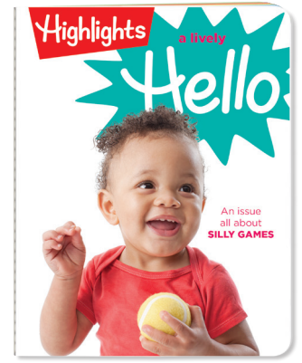
Hello Ages 0–2 Learn More >