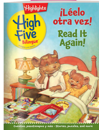
High Five Bilingüe Ages 3–5 Learn More >