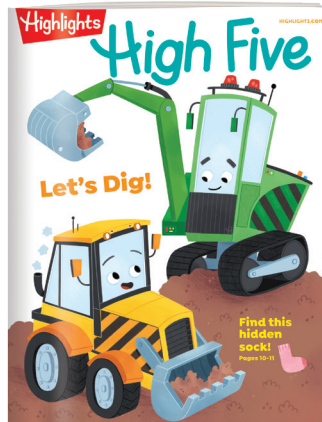
High Five Ages 3–5 Learn More >