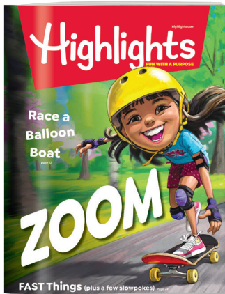
Highlights Ages 6–12 Learn More >